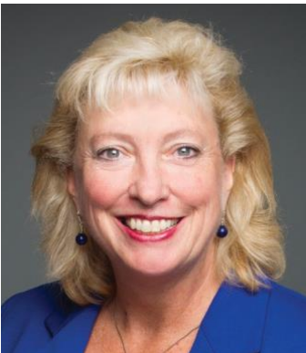
Marilyn Gladu, M.P. Government of Canada

Marilyn Gladu spent over twenty years as a leader in research and development in the petrochemical industry before entering politics. From over three decades of leadership in the engineering world to her new role as the first female engineer to be elected as a Member of Parliament, she has been an extraordinary role model for women in engineering. As “Canada’s Most Collegial MP,” and through her role as Vice-Chair of the House of Commons Standing Committee on Health, she continues to demonstrate the role that an engineer can have in improving the lives of all Canadians.